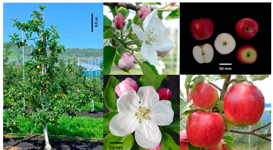
Fig. 2. Tree, flower, and fruit of the apple cultivar Arisoo.

Received for publication 25 Feb. 2021. Accepted for publication 2 June 2021.