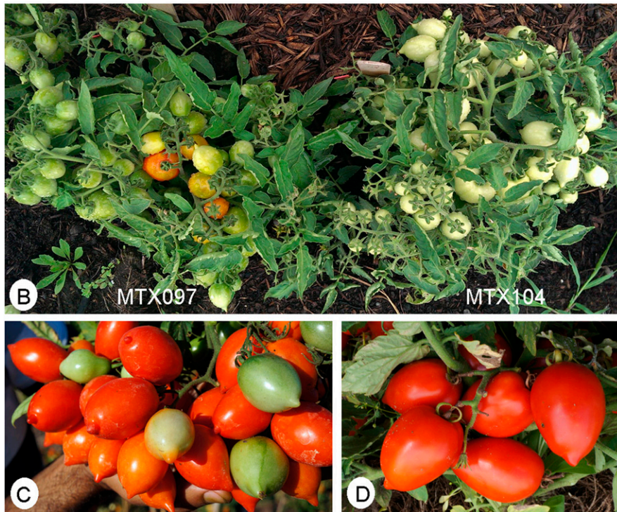
Fig. 1. Origin, plant, and fruit forms of ‘Ground Jewel’ and ‘Ground Dew’. (A) Pedigree of ‘Ground Jewel’ and ‘Ground Dew’. Both cultivars were selected from a cross between ‘Zac-Heart’ and ‘Micro-Tom’. MTX97 and MTX104 were selected from the F4 population; both MTX97 and MTX104 continued selfing for four more generations with stable phenotypes and named ‘Ground Jewel’ and ‘Ground Dew’, respectively. (B) Side-by-side growth and comparison of ‘Ground Jewel’ (MTX097) and ‘Ground Dew’ (MTX104). Both lines develop oval-shape fruits with a pointer/nib on each fruit. The main difference between these two lines is observed in the young fruits: young fruits of ‘Ground Jewel’ develop green shoulders and ‘Ground Dew’ have white young fruits. (C) A mature fruit cluster of ‘Ground Jewel’. (D) A mature fruit cluster of ‘Ground Dew’.