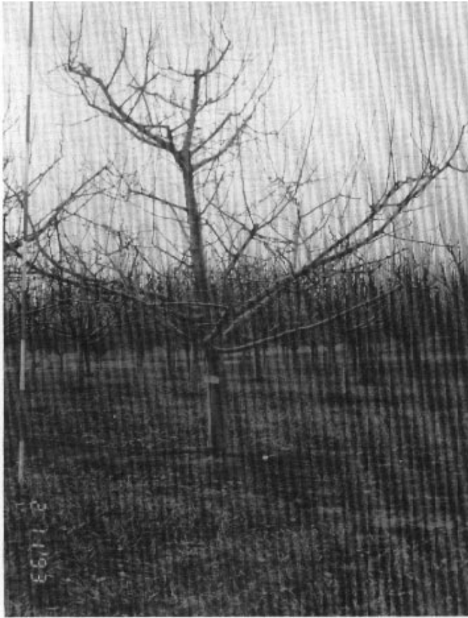
Fig. 2. Center-leader training system.

carried no fruit and was completely removed after the 1990 growing season. Mature tree height of open-center trees was \approx 2.5 m at the outer edges of the canopy. During dormant pruning, branches that might interfere with harvester movement and fruit detachment were removed.