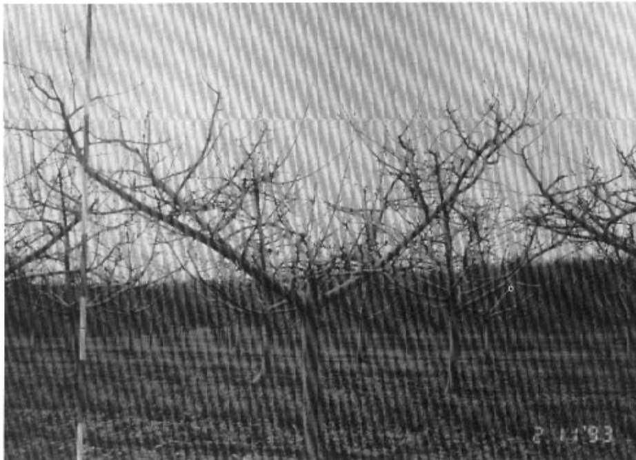
Fig. 3. Open-center training system.

carried no fruit and was completely removed after the 1990 growing season. Mature tree height of open-center trees was \approx 2.5 m at the outer edges of the canopy. During dormant pruning, branches that might interfere with harvester movement and fruit detachment were removed.