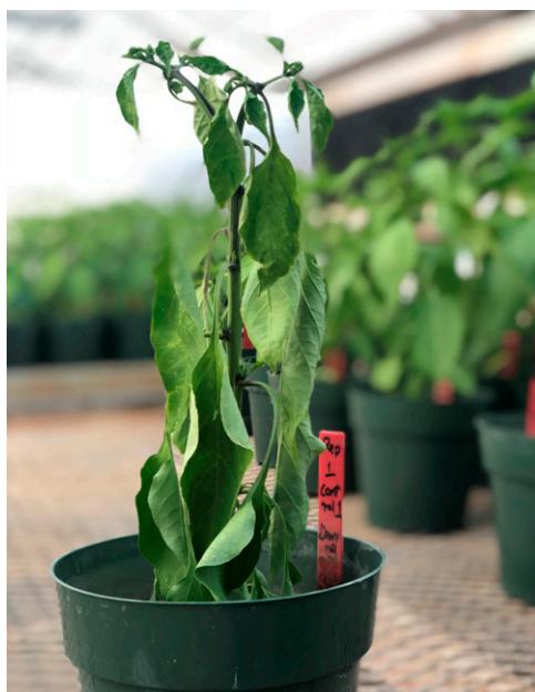
Fig. 1. Symptoms of Verticillium wilt on a chile pepper plant grown in a greenhouse. Soil supporting this plant was watered to saturation daily.

by foliar chlorosis and premature senescence (Goldberg 2010).