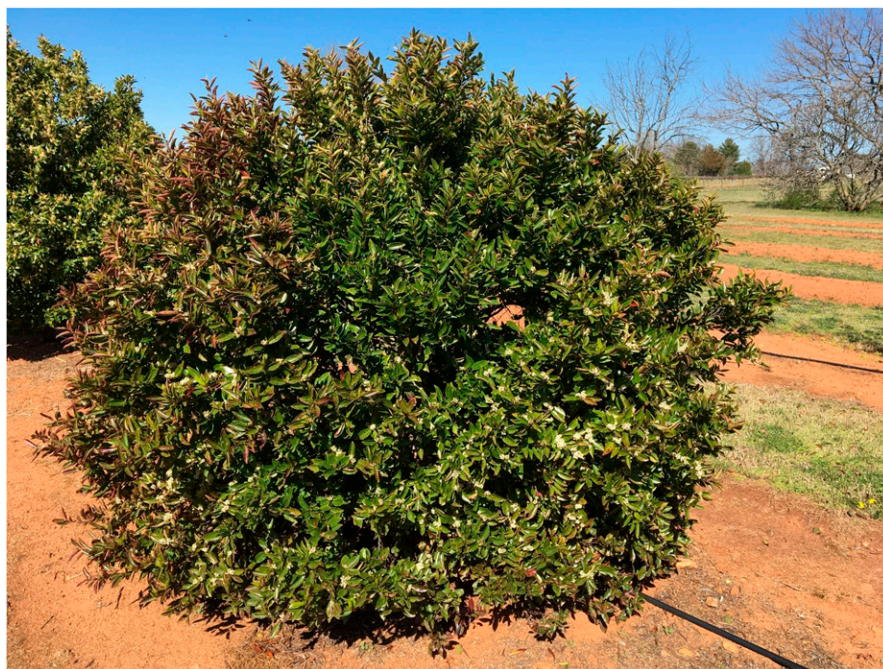
Fig. 1. A compact, globose, sterile M1 (first generation of mutagen-treated seedlings) carolina laurel cherry selection with remaining hints of reddish winter coloration. Photograph taken 2 Mar. 2017 as flower buds are expanding.

Although carolina laurel cherry is often listed as having perfect flowers (Dirr, 1998), the species is known to be andromonoecious (Wolfe and Drapalik, 1999), producing both male and bisexual flowers. A study was conducted in Mar. 2018 to determine the number of male flowers and all-male racemes on two control plants and 15 advanced selections. Ten random branches were collected from each tree. Five random racemes on each branch were selected and the gender of 10 flowers per raceme was determined. The results of this study are based on the measurement of 170 branches, 850 racemes, and 8500 flowers. Data calculations for number of male flowers, fruit rating, and number of all-male racemes and correlation analysis were conducted using the Statistical Package add-on in