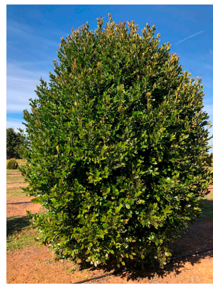
Fig. 3. An upright sterile M2 (second-generation seedling from M1 parents) carolina laurel cherry selection that has received no pruning. Photograph taken 26 Feb. 2018.

andromonoecious species. In their study, ≈80% of the flowers sampled were male compared with 41% in this study. Furthermore, male flower production on a per-plant level in their study ranged from 38% to 98% with 5 of their 10 plants having >80% male flowers. Male flower production in this study on a per-plant level ranged from 8% to 83% with only 3 of 17 plants producing more than 60% male flowers. Of interest is that the one M2 selection that had a heavy fruit rating = 4 (>50 per plant) had the lowest number of male flowers in the study with only 22. The two control plants that both had fruit ratings of 4 had 31% and 69% male flowers, respectively. Interestingly, the colored engraving plate of carolina laurel cherry [as wild orange ( Cerasus caroliniana )] in The North American Sylva (Michaux, 1819) shows flowering racemes that appear