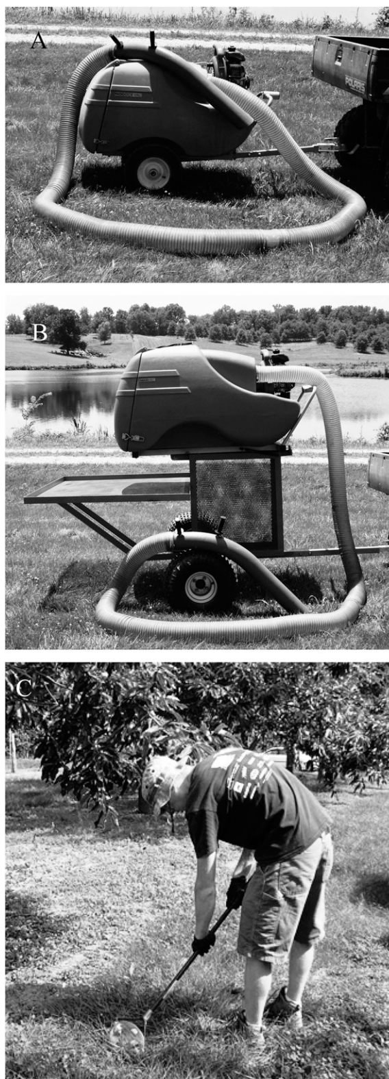
Fig. 1. Harvest equipment evaluated for harvesting chinese chestnuts: (A) pasture vacuum (Paddock Vac; Greystone Vacuums, Monroe, WA), (B) modified pasture vacuum (Maxi Vac, Greystone Vacuums) with raised collection tank and open-weave metal shelf, and (C) manual nut-harvesting tool (Nut Wizard, Holt’s Nut Wizard, Douglas, GA).

3 Corresponding author. E-mail: warmundm@missouri.edu.