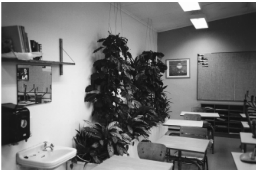
Fig. 3. The biological classroom (Study 3) was created by adding foliage plants in a bioprocess system and by using full-spectrum lighting.

ber 1997 to February 1998. Demographics and information on how much of the workday each employee spent in the room were also gathered. All together 51 air samples were collected before and after intervention, in order to analyze possible changes in content of fungi in the air. Air samples were analyzed by the Norwegian Institute for General Health, Oslo.