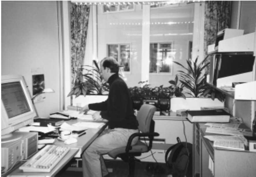
Fig. 1. In the office experiment in Study 1, three self-watering containers filled with common interior plants were placed on the window bench during the intervention with plants. In addition, a terracotta container with plants stood in the back corner of the office (not shown in the photograph).