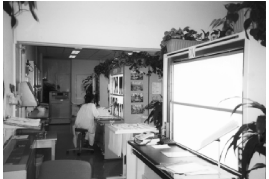
Fig. 2. The radiology department location (Study 2) during the intervention received 23 plant containers, both on top of the film viewers and on the floor. Full spectrum lighting was also added.

1995 and 3 months in Spring 1996. The questionnaire, modelled after Anderson et al. (1993), covered 12 different health symptoms. The scores reflect problems or symptoms on the exact day that the questionnaire is filled in. Each symptom could be given one of the following scores: 0 (no problems), 1 (minor problems), 2 (moderate problems), or 3 (severe