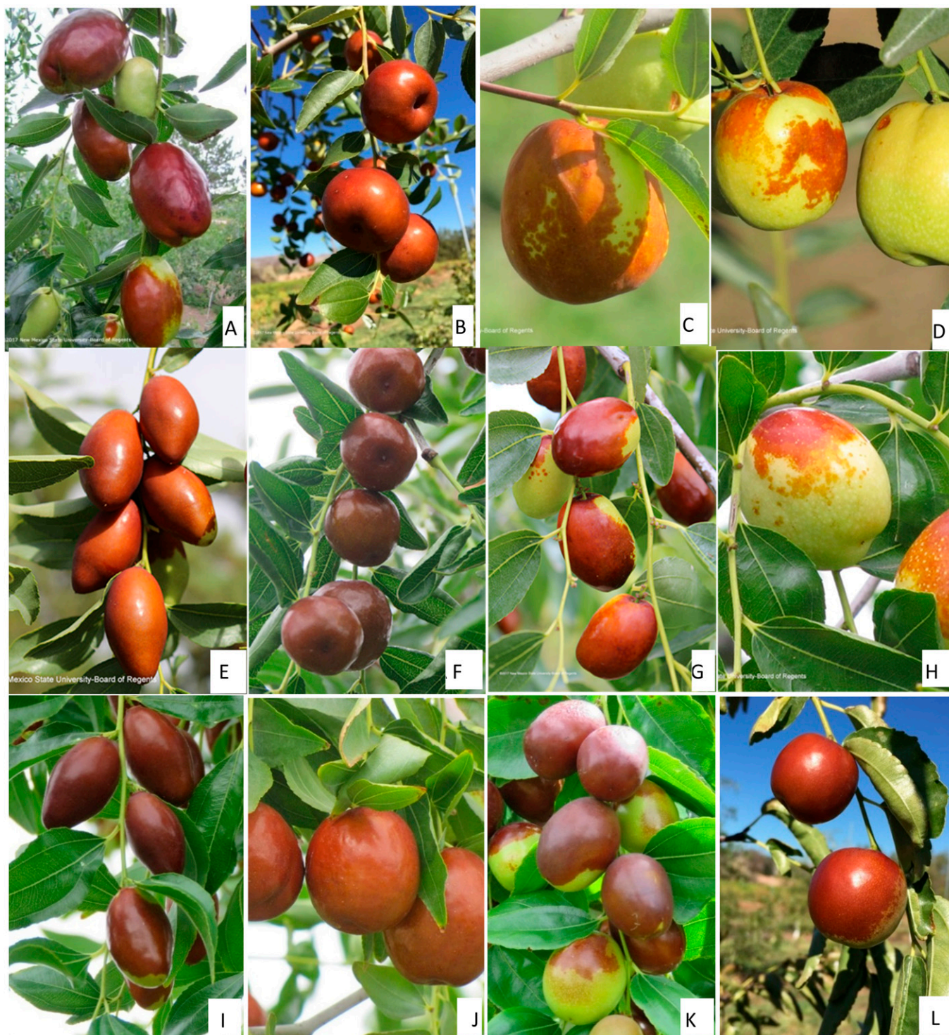
Fig. 2. Fruit pictures of different jujube cultivars in New Mexico. (A) 'Alcalde #1'. (B) 'Chico'. (C) 'Dabailing'. (D) 'Daguazao'. (E) 'Gaga'. (F) 'Honeyjar'. (G) 'Kongfucui'. (H) 'Li'. (I) 'Maya'. (J) 'Redland'. (K) 'Russian 2'. (L) 'Sandia'.

similar after 3 years of growth in the field, trees were more vigorous and upright at Los Lunas than at Alcalde 4 years after planting. Orchard management also affects tree growth, especially the frequency of irrigation. In general, trees are larger at more southern locations than in northern locations.