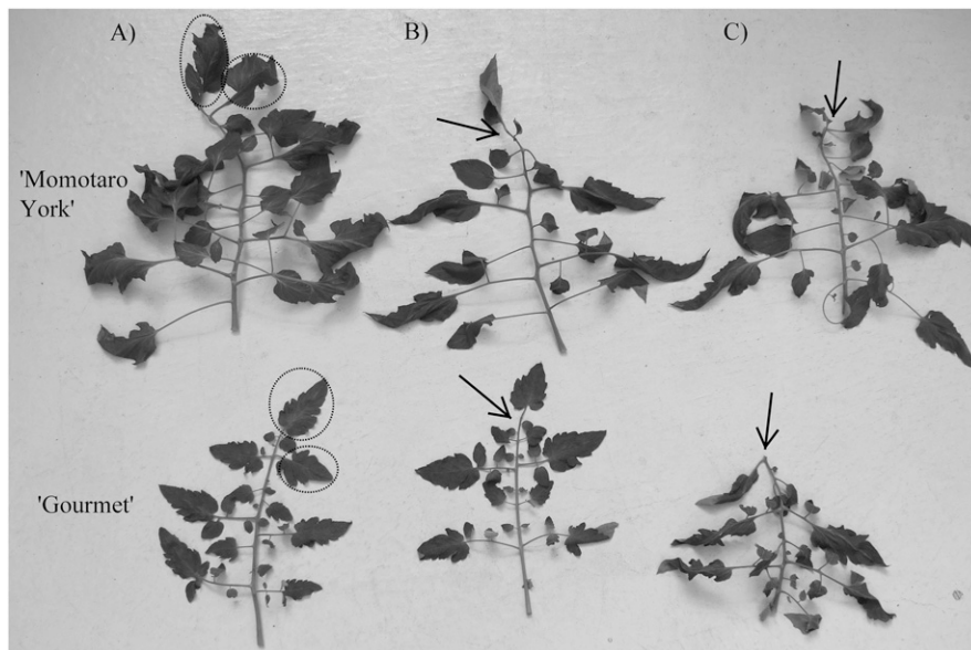
Fig. 1. Alteration of tomato leaf shape in Dutch cultivar Gourmet and Japanese cultivar Momotaro York at the end of the experiment. (A) No trimming; (B) trimming of young leaf; (C) trimming of mature leaf. Arrows show the site of trimming. First and second leaflets counting from the apex of each leaf were trimmed.

To test the effects of leaf shape, we compared plants with intact leaves with plants whose leaves were trimmed while young or when mature (Fig. 1). In the control treatment, we left plants untrimmed. In the young-leaf treatment, when each leaf had reached ≈5 cm length, we trimmed the first and second leaflets counting from the apex of