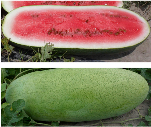
Fig. 4. USVL-380 fruits harvested in the field in Charleston, SC (Summer 2015).

or Kai-shu Ling, U.S. Vegetable Laboratory, 2700 Savannah Highway, Charleston, SC 29414-5334. Seed of USVL-380 will also be submitted to the National Plant Germplasm System where it will be available for research purposes, including the