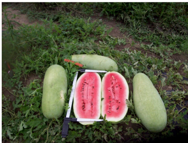
Fig. 3. USVL-380 fruits harvested in the field in Charleston, SC (Summer 2014).

USVL-380 is a sister line of USVL-370 and has the same breeding scheme for this