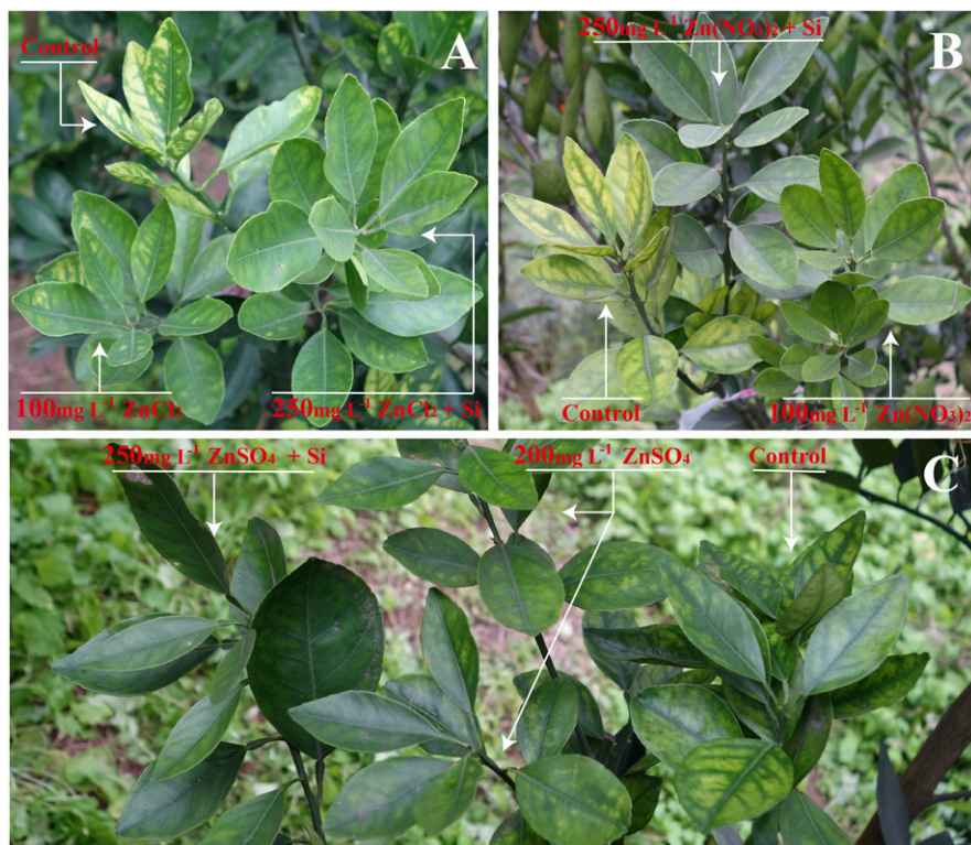
Fig. 2. Recovery of zinc (Zn)-deficient leaves after spraying with various Zn fertilizers. Zn-deficient leaves of 6-year-old ‘Fengwan’ navel orange autumn twigs sprayed with (A) water (control), 100 mg·L -1 of Zn from ZnCl 2 , and 250 mg·L -1 of Zn from ZnCl 2 with 0.025% organosilicone (Si), (B) 100 mg·L -1 of Zn from Zn(NO 3 ) 2 ·6H 2 O and 250 mg·L -1 of Zn from Zn(NO 3 ) 2 ·6H 2 O with 0.025% of Si, and (C) 200 mg·L -1 of Zn from ZnSO 4 ·7H 2 O and 250 mg·L -1 of Zn from ZnSO 4 ·7H 2 O with 0.025% of Si for 60 d. Similar results were determined in Midnight Valencia orange (data not shown).

It is well known that Zn deficiency lowers chlorophyll levels and photosynthetic activity of plants (Cakmak, 2000; Chen et al., 2008; Fu et al., 2014; Hu and Sparks, 1991). In this study, the similar result was found in untreated Zn-deficient leaves (Table 4). This is possible because Zn deficiency resulted in deformation of chloroplast structure and limitation of photosynthetic enzymes, such as carbonic anhydrase, fructose-1,6-bisphosphase, and ribulose 1,5-bisphosphate carboxylase/oxygenase (Chen et al., 2008; Sasaki et al., 1998). In addition, Zn deficiency could also decrease the intercellular CO 2 concentration and g s , resulting in reduction of photosynthesis (Sharma et al., 1995). Application of the three Zn fertilizers on Zn-deficient leaves significantly increased their chlorophyll levels and photosynthetic activities, especially when organosilicone was supplemented. Moreover, better recovery of green and higher chlorophyll levels and photosynthetic activities were observed on ZnCl 2 - and Zn(NO 3 ) 2 ·6H 2 O-treated leaves,