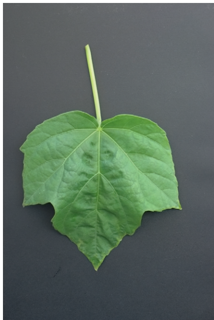
Fig. 2. Leaf of 'Robert Brown' winter-hardy hibiscus.