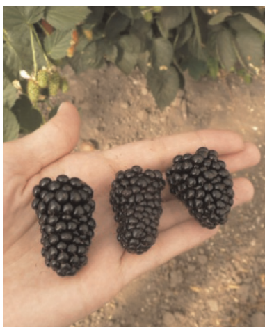
Fig. 2. Primocane fruits of ‘APF-45’ in California.

z Data are means of four replications for ‘APF-12’ and two replications of ‘APF-45’ that were in adjacent rows, not a single planting (no mean separation provided as a result of not an appropriate design for analysis). ‘APF-12’ plants were planted in 2004 and ‘APF-45’ in 2005, and all plants were fully mature at the time of data collection.