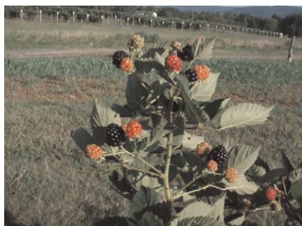
Fig. 3. 'APF-45' with fruits on primocane, Clarks-ville, AR.

harvest date for 'APF-45' was 10 June, 2 d after 'APF-12', 5 d after 'Natchez', and 3 d before 'Ouachita' (Table 3). Peak and last harvest dates had similar trends.