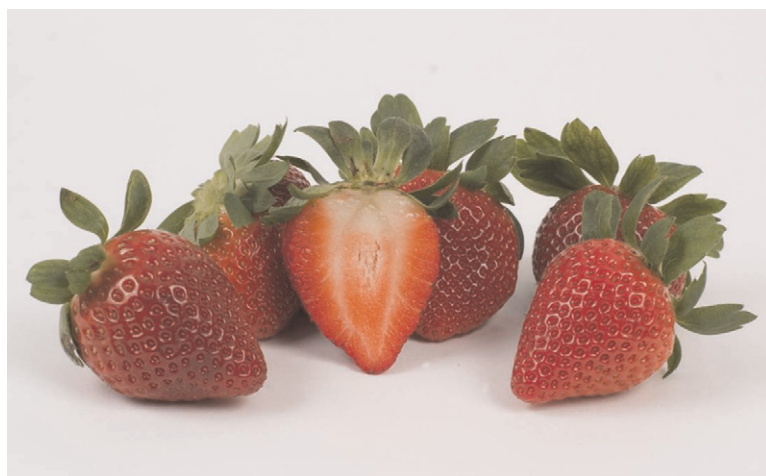
Fig. 2. Fruit of 'Florida Radiance' strawberry.

y Means based on four replications of 10 plants each. Mean separation within columns by Fisher's protected least significant difference test ( P < 0.05 ).