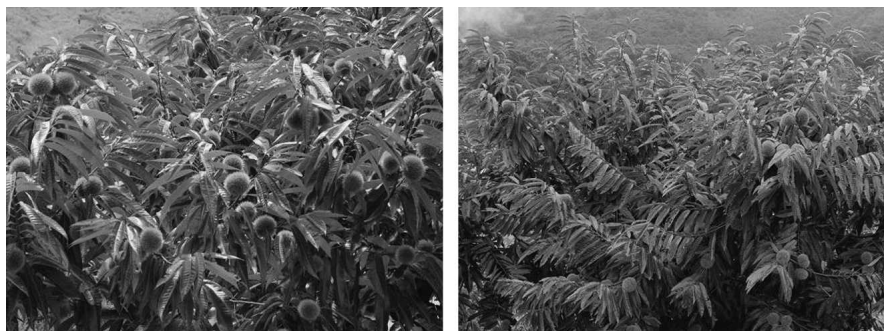
Fig. 1. Fructification of ‘Arima’ (left) and ‘Mipung’ (right) in late September.

Received for publication 7 Apr. 2008. Accepted for publication 10 July 2008.