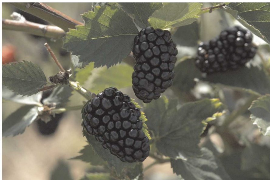
Fig. 2. Fruit of 'Natchez' blackberry.

horizontally 1.0 m. Vigor rating of 'Natchez' was good and similar to the other cultivars (Table 2). Average health rating for 'Natchez' was good, near that of 'Arapaho' and 'Navaho' but slightly lower than 'Ouachita' and 'Apache' (Table 2). No orange rust [caused by Gymnoconia nitens (Shwein.) F. Kern & H.W. Thurston] has been observed on 'Natchez' in any evaluations, although infected plants have been seen within 30 m of plots of 'Natchez'. 'Natchez' is moderately resistant to anthracnose, because only a small amount of anthracnose was noted on berries or leaves in one of 4 years in the selection observation planting in evaluations where a single spray of lime sulfur was applied. Reaction of 'Natchez' to rosette/double blossom [ Cercospora rubi (Wint.) Plakidas] has not been evaluated. We expect 'Natchez' to be resistant to this disease as are the other Arkansas thornless cultivars, and 'Natchez' should hold promise for production in areas where this disease is limiting.