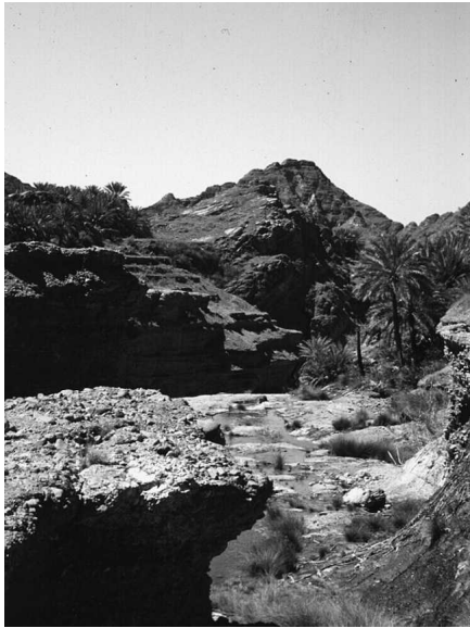
Fig. 1. The Khattwa Oasis in Oman is representative of the types of conditions in which date palms originated and are adapted. Traditional date palm cultivation is still practiced in such oases.