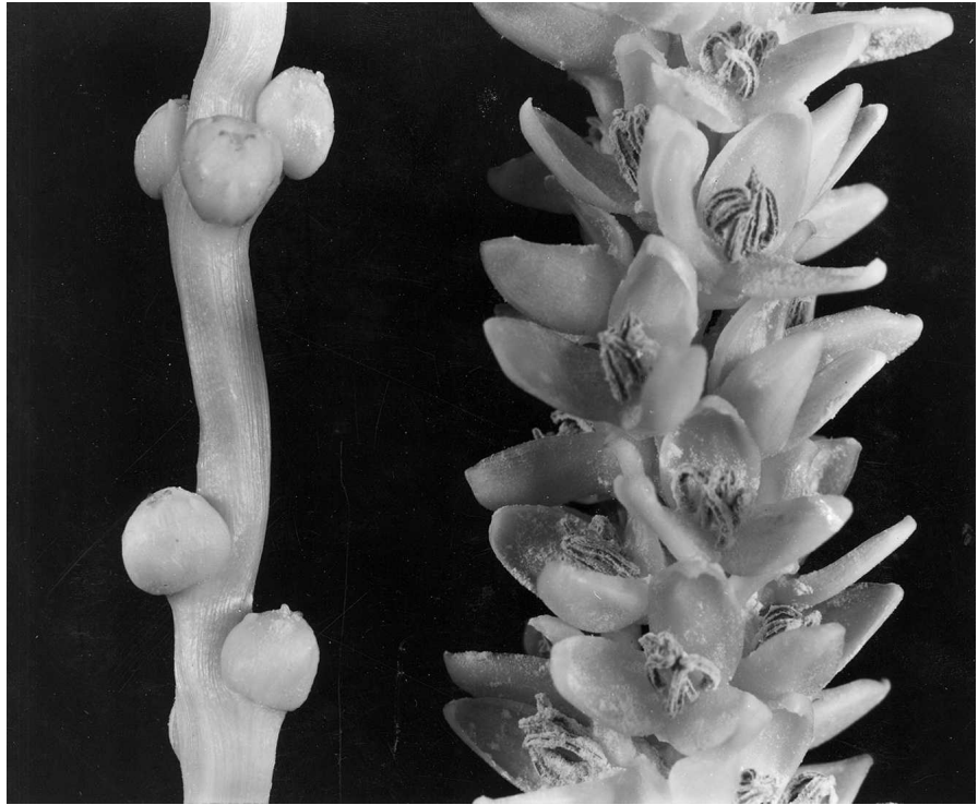
Fig. 2. Male (left) and female (right) flowers of date palm.

belonging to Palmaceae (Barrow, 1998). The name of date palm originates from its fruit; “phoenix” from the Greek means purple or red (fruit), and “dactylifera” refers to the finger-like appearance of the fruit bunch. Date palm is dioecious, meaning it has separate female and male trees. Throughout the years, there have been various reports of hermaphroditic trees developing, or male trees developing female characteristics (Sudharsan and Abo El-Nil, 1999). Inflorescences of female and male trees differ in morphology (Nixon and Carpenter, 1978; Swingle, 1904; Vandercook et al., 1980). Both are enclosed in a hard, fibrous cover (the spathe) that protects the flowers from heat and sunlight during the early stage of flower development.