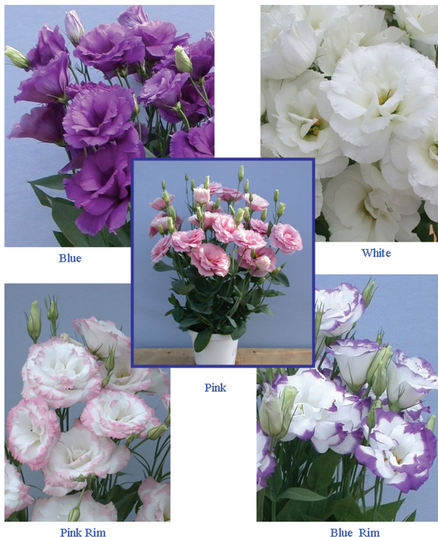
Fig. 1. 'UF Double Joy Blue', 'UF Double Joy White', 'UF Double Joy Pink', 'UF Double Joy Pink Rim', and 'UF Double Joy Blue Rim' F 1 heat-tolerant and double flowering lisianthus.

UF05-185 was the F 2 of a cross between UF96-267 (Harbaugh and Scott, 1996), a very floriferous, basal branching and heat-tolerant line, and UF99-482. UF99-482 was the F 2 of UF97-185 and 'Double Echo Pink Picotee' that was used for its double flowers. A blue