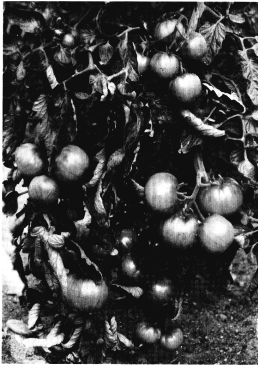
Fig. 2. Fruits of 'Freda'.

Selection for parthenocarpy was done in a greenhouse during the coldest period of the year, when minima averaged 5.1C and maxima 23C.