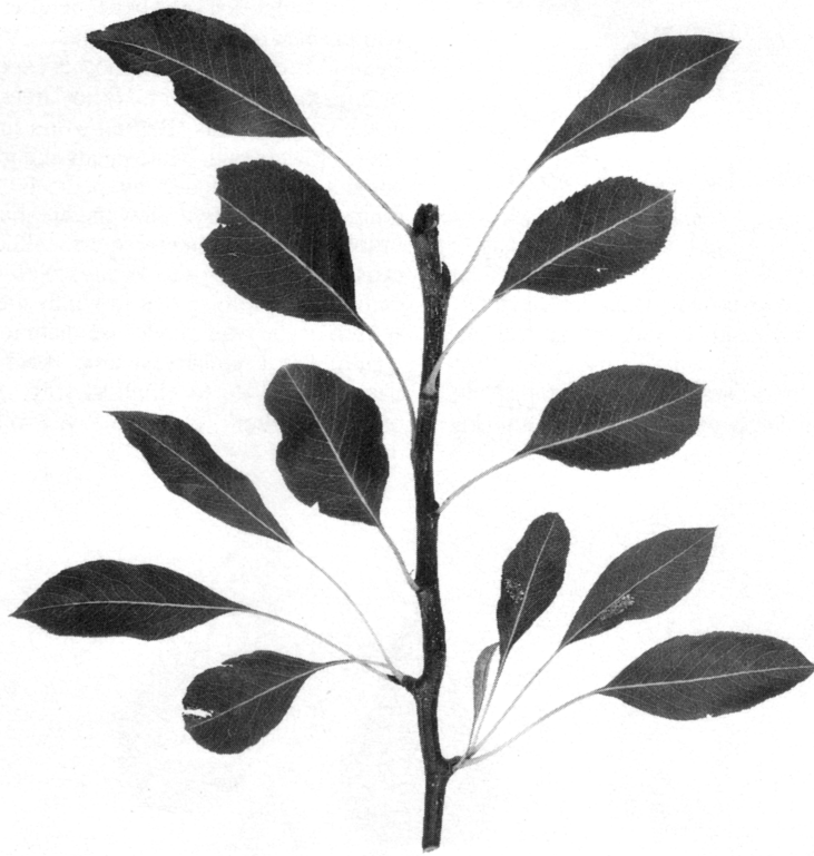
Fig. 3. Leaf variations and spurring habit of 'Elliot' pear.

propagated on 'Winter Nelis' seedlings have not manifested any sign of biennial bearing. 'Elliot' is graft-compatible with 'Old Home' rootstock; it has not been tested on other rootstock species.