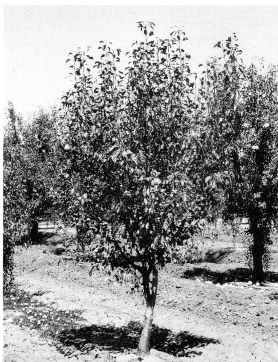
Fig. 2. Upright growth habit of a 9-year-old 'Elliot' pear grafted on 'Winter Nelis' seedling rootstock.

Received for publication 5 Dec. 1988. The cost of publishing this paper was defrayed in part by the payment of page charges. Under postal regulations, this paper therefore must be hereby marked advertisement solely to indicate this fact.