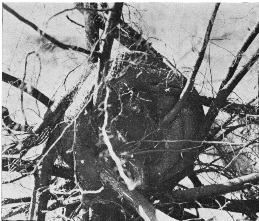
Fig. 2. Severe root circling and kinking of a one-year field-grown, one-year container-grown pecan tree; roots were not pruned prior to transplanting.

g/tree beginning in 1978, with the rate increasing 227 g/year. Standard pecan-orchard maintenance practices were used to control weeds, insects, and diseases.