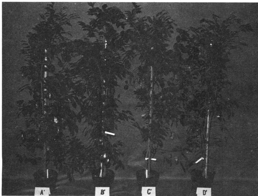
Fig. 2. Postharvest effects when plants were held in SIE 10 weeks under INC lamps at 15 \mu\text{Em}^{-2}\text{sec}^{-1} (PAR) following dark storage treatments. (A) Control; (B) 4 days; (C) 8 days and (D) 12 days.