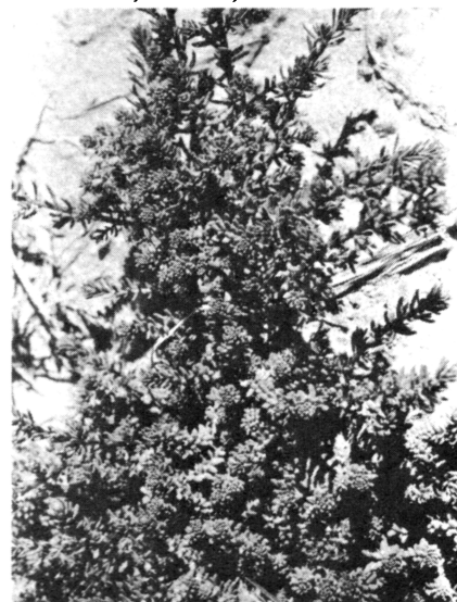
Fig. 1. Foliage of 'Beersheva' suaeda .