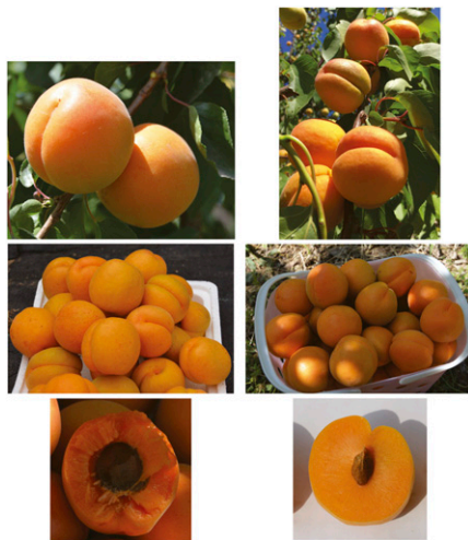
Fig. 2. Photographs of 'Jinyu' (left) and 'Jinhe' (right) apricot fruit on the tree (top), after harvest (middle), and sections (bottom).

cut the water sprouts, competitive branches, and densely packed branches, which facilitates the control of plant growth and improves ventilation and light conditions. Flowering branches that are weak or too long should be pruned before flowering in winter, and attention should be paid to control and balance tree potential.