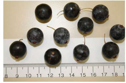
Fig. 7. Large berries from a diploid plant of V. stamineum (clone FL15-695) harvested from a forest in Alachua County, FL, July 2015. Pedicels remain attached to the berries when they abscise from the peduncle. The scale is in centimeters.

When extracting seeds from crosses, it was noticed that a 50:50 (by volume) mix of water and fresh berries homogenized in a