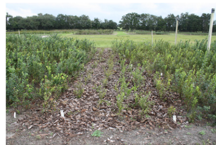
Fig. 1. Seedlings in the 2019 high-density nursery photographed 22 Oct. 2020. The nursery was planted 30 May 2019 using greenhouse-grown seedlings from seed planted in Nov. 2018. The four weakest rows in the center contain F 1 hybrids from highbush × tetraploid V. stamineum crosses. The more vigorous rows on the left contain seedlings obtained by intercrossing BC 1 seedlings that had V. stamineum as the recurrent parent, and those on the right contain F 2 seedlings from F 1 × F 1 crosses.

With rare exceptions, F 1 hybrids obtained by crossing tetraploid highbush cultivars with tetraploid V. stamineum were far weaker than either parent (Fig. 1). F 1 hybrids varied greatly in vigor depending on the particular highbush and V. stamineum plants that were crossed. Sibling seedlings within some crosses were highly variable in vigor, but in other crosses all the seedlings were very weak. About half the F 1 seedlings from the most vigorous half of the crosses could probably have been brought to flowering if potted and grown in a greenhouse. When the strongest F 1 plants were dug, potted, and placed in the greenhouse, most of them increased in vigor but remained less vigorous than highbush seedlings. The weakness of the F 1 hybrids in the high-density field nurseries was probably a result, in part, to excess soil moisture. Overhead irrigation scheduling was adjusted to maximize the growth of highbush seedlings planted in other parts of the same nursery. These were far more vigorous and required much more water than the hybrids. Year after year, F 1 seedlings were much more susceptible to leaf mites ( Eotetranychus clitus ) in the greenhouse than either parent growing in the same greenhouse. To prevent defoliation, it was necessary to control mites. Of the original four tetraploid V. stamineum plants used repeatedly in crosses, FL13-1145 consistently