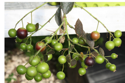
Fig. 4. Clusters of berries on an F 1 hybrid in the greenhouse showing long pedicels and peduncles. The flowers had been pollinated with pollen from a highbush cultivar. The plant had been defoliated by mites during berry development.