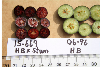
Fig. 6. Internal berry color of freshly sliced mature berries of tetraploid selection FL 15-669 (a highbush cultivar × tetraploid V. stamineum F 1 hybrid) and highbush cultivar FL06-96.

Berry size . Deerberries in the forest are larger than those of any other wild North American Vaccinium species (Fig. 6). Mean weight of 100 individually weighed berries selected randomly from each of three heavily loaded V. stamineum plants in the forest in Alachua County, FL, on 8 July 2020 were 1.24, 1.37, and 1.15 g, respectively, with SEMs of 0.057, 0.035, and 0.023. Mean berry weight for 23 wild tetraploid highbush blueberry plants ( V. fuscatum ) from Alachua County, FL, ranged from 0.14 to 0.54 g, with an overall mean for the 23 plants of 0.25 g (Lyrene and Sherman, 1980). Berries of the highbush cultivars grown in Florida are large because of 6 to 10 generations of selection for large berries. Berries on the most vigorous and fertile BC 1 plants averaged about as large as berries from random seedlings from highbush × highbush cultivar crosses, indicating that V. stamineum introgression had not reduced berry size.