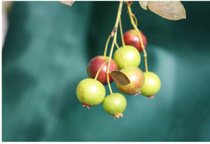
Fig. 5. Loose clusters of berries on an F 1 hybrid in the greenhouse after the flowers had been pollinated with pollen from a highbush cultivar.

Habropoda . Achieving adequate pollination using honeybees has been a problem for growers in commercial blueberry plantations in Florida and Georgia. Flowers of most highbush cultivars have a long corolla tube, which has a constricted aperture and anthers located well inside the tube. By contrast, in V. stamineum , the corolla cup is short, with a wide opening, and both the stigma and anthers extend well beyond the end of the corolla cup (Cane et al., 1985). The pollen and stigmas are readily accessible to honeybees and other nonsonicating pollinators. Flower structure in F 1 and F 2 hybrids was surprisingly variable. All F 1 plants had flower morphology somewhere between that of the parents; but, in some, flowers were more like those of V. stamineum and, in others, more like those of highbush. Flowers on both F 1 and BC 1 plants tended to be smaller than on highbush. Flowers of all F 1 plants had anther awns, which are absent in highbush and conspicuous in V. stamineum , but these were invariably smaller than in V. stamineum . Flower structure remained quite variable in BC 1 (to highbush) hybrids, and plants could be selected in which the pollen is readily accessible to honeybees. In many BC 1 hybrids, the pollen discharge tubes extend all the way to the stigma, and both are near the aperture of the corolla tube. In highbush flowers, the anthers are situated deep inside the corolla tube.