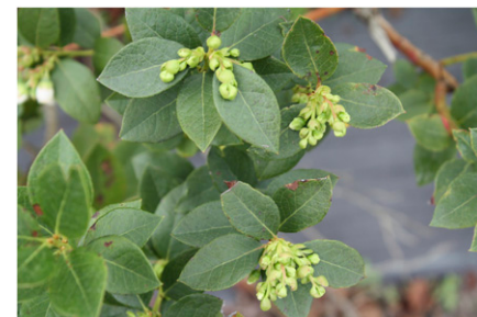
Fig. 3. BC 1 seedlings with inflorescence structure intermediate between that of highbush and V. stamineum . Peduncles elongate well before the flowers open. Photographed 22 Oct. 2020.

Flowers of blueberry species in section Cyanococcus are adapted to buzz pollination by native bees such as Bombus and