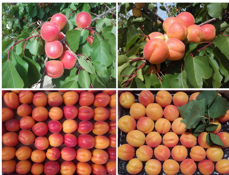
Fig. 2. ‘Cebasred’ (left) and ‘Primorosa’ (right) fruits in the tree and after harvesting.

Ripening time. The ripening date for ‘Primorosa’ in our experimental conditions in Murcia (southeast of Spain, lat. 37°N, long. 1°W, and 350-m altitude) is ≈6 May, similar to the earliest ripening traditional Spanish cultivar Currot and the very early ripening releases from CEBAS-CSIC ‘Mirlo Blanco’ and ‘Mirlo Anaranjado’ (Egea et al., 2010). The ripening date for ‘Cebasred’ is ≈30 Apr., around 7 d earlier than ‘Primorosa’ and Currot, ≈26 d earlier than the Spanish cultivar Búlida, and 28 d earlier than the North American cultivar Orange Red (Table 1). This means that ‘Cebasred’ is considered as an extra-early cultivar with the earliest date of ripening of all the apricot cultivars grown in Spain. Fruit of both cultivars ripen uniformly. At that time in the season, there is very limited competition with apricots produced from other European countries, mainly in the case of ‘Cebasred’.