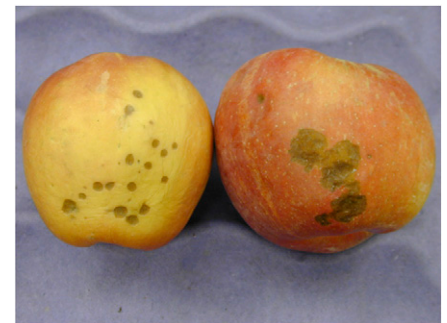
Fig. 1. Bitter pit (left apple) and peel blotch (right apple) symptoms on 'Honeycrisp' apples.

All lots developed DFB but incidence did not exceed 10%. An atmosphere main effect for DFB was present for lot A, and in year 1 establishment of CA 1 d after harvest resulted in a lower incidence compared with fruit stored in air. In year 2, fruit stored in air had less DFB compared with fruit stored in CA. There were no treatment effects for lots B, C, D, or E as DFB incidence was 4% or less. Cavity development also occurred in all lots with the highest incidence value of 18%. For lots A and B, an atmosphere × 1-MCP interaction was present in year 2. The only lot A fruit with cavities were 1-MCP-treated and stored in CA, whereas the only lot B fruit that