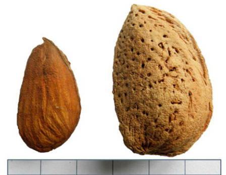
Fig. 2. Nut and kernel of ‘Matan’ almond. Each black/white square is equivalent to 1 cm.

sometime until harvested. ‘Um ElFahem’, the main commercial cultivar in Israel, matures at Newe-Ya’ar in the end of July and ‘Lauranne’ 2–3 weeks later.