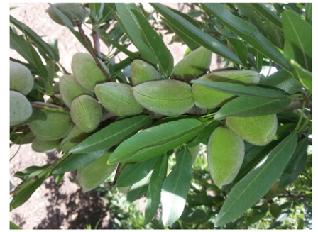
Fig. 1. ‘Matan’ branch: leaves and green nuts (photo taken in June at Newe Ya’ar Research Station).

Harvest maturity. ‘Matan’ is ready for harvest at the beginning of August. In Newe Ya’ar, it is picked from \approx 1 \text{ Aug.} to 15 Aug. The hull can easily be removed. It is readily picked by an almond shaker, with high efficiency, leaving a small quantity of almonds on the tree. However, it is not immediately dropping and can remain on the tree