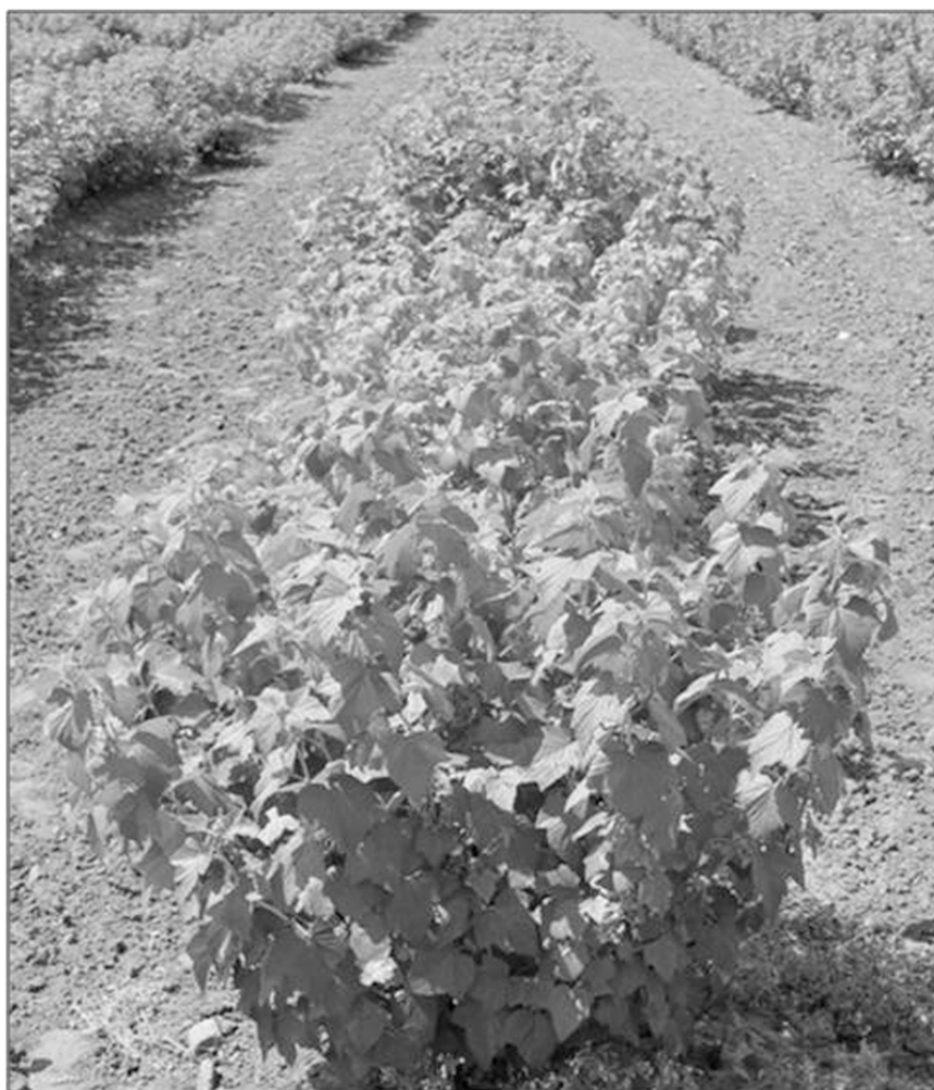
Fig. 2. Bush of Ribes nigrum ‘Tihope’.

z Means within columns marked with the same letter do not differ significantly at P = 0.05 , according to the Duncan’s multiple range test.