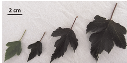
Fig. 3. Representative leaves (left to right) of: Physocarpus opulifolius 'Nanus', 'Donna May' (Little Devil™), 'Seward' (Summer Wine™), and 'Monlo' (Diabolo®).

May' was among those uninfected. Infrequent powdery mildew infections leading to sporadic witches' brooms (consistent with Podosphaera aphanis var. physocarpis ) have been observed on plants of 'Donna May', similar to what has infrequently been observed on 'Seward' (Summer Wine™; also a descendent of 'Nanus' and 'Monlo'; personal observation).