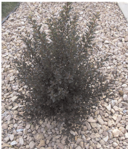
Fig. 1. 'Donna May' eastern ninebark in a St. Paul, MN, landscape July 2012 having been planted from a #1 nursery container the previous growing season.