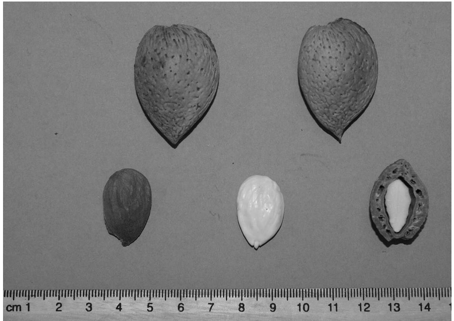
Fig. 2. Nut and kernel of 'Mardía'.

the Spanish industry. Kernels also show a very good aspect and good size ( 1.2 \pm 0.2 g), heart-shaped, without double kernels (Fig. 2). Industrial cracking has been carried out by the Cooperative "Frutos Secos Alcañiz" and has shown very good results without the presence of double layers in the shell. Kernel breakage at cracking has been low with 86.2% of whole kernels.