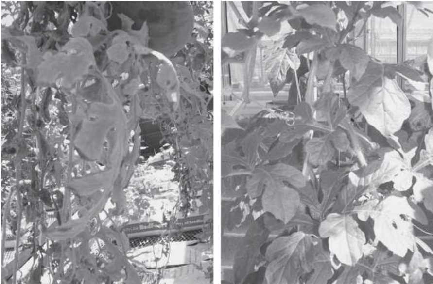
Fig. 1. Whole plant response to infection with powdery mildew in greenhouse-grown watermelon plants is shown. The plant on the left is Dixielee x Black Diamond F1 (susceptible), and the plant on the right is PI 525088-PMR (resistant).