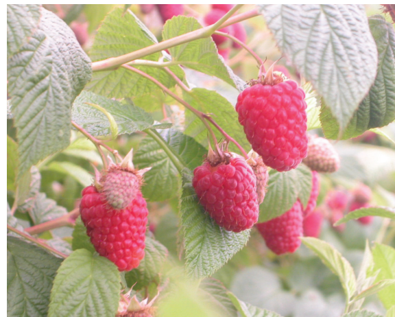
Fig. 2. Fruit of ‘Cascade Dawn’.