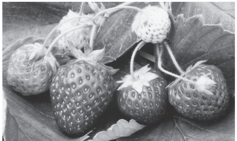
Fig. 1. Fruit of 'MNUS 248' strawberry.

'MNUS 248' generally produced high yields and medium-large berries compared to other cultivars in Minnesota trials (Table 1). The fruit matured in the middle part of the season for short-day cultivars (mid-June to mid-July in Minnesota), about the same time as its parent, 'Glooscap', and other common midseason cultivars grown in Minnesota, such as 'Kent', 'Jewel', and 'Cavendish'. In all Minnesota trials, 'MNUS 248' consistently had yields similar to or greater than these other mid-season cultivars. Compared